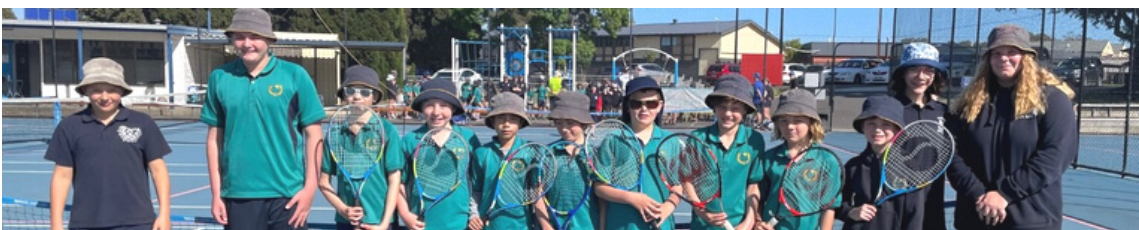
The Flying Fish