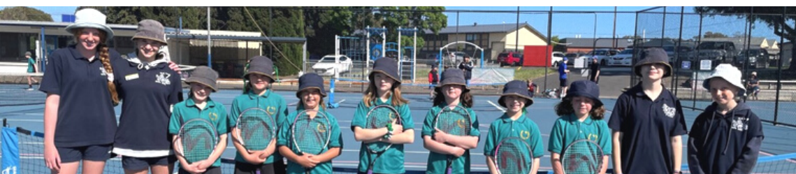
The Golden Girls