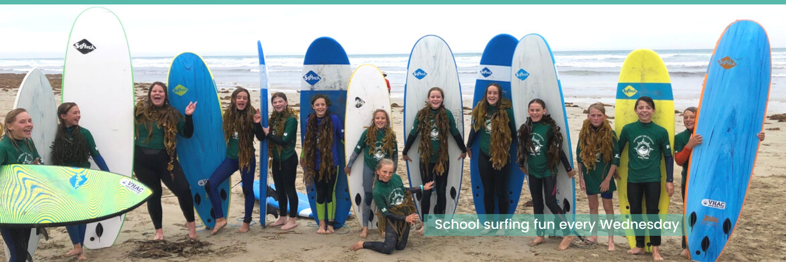
School surfing fun every Wednesday